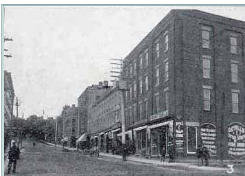
A view of the corner of Ontario and Walton Street with the Wilson Block on the right. The sign on the exterior of the building advertises Deyell's Drugstore which was in the block from approximately 1870 into the twentieth century when this photo was taken in the early 1900's.