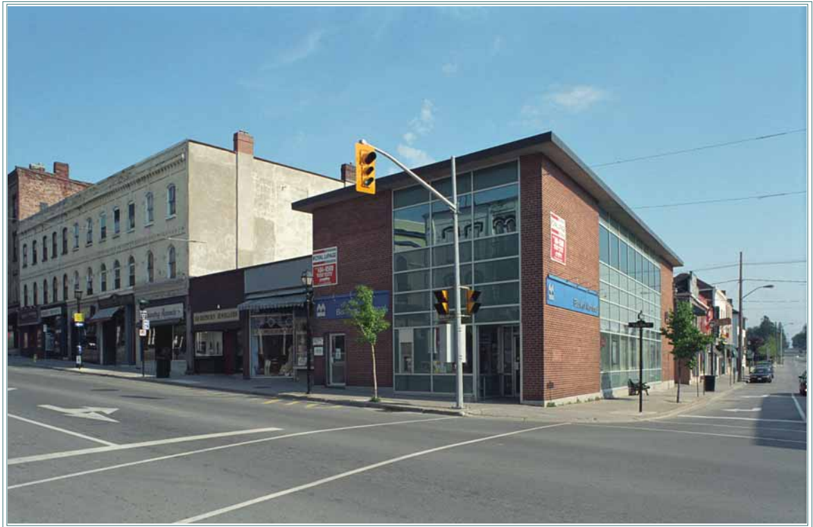
WILSON BLOCK circa 1853 (REPLACEMENT 1955)

Date Designated: October 6, 1997 to By-Law No. 44/97