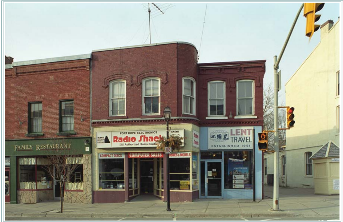
MEREDITH BUILDING circa 1871

Date Designated: October 6, 1997 to By-Law No. 44/97