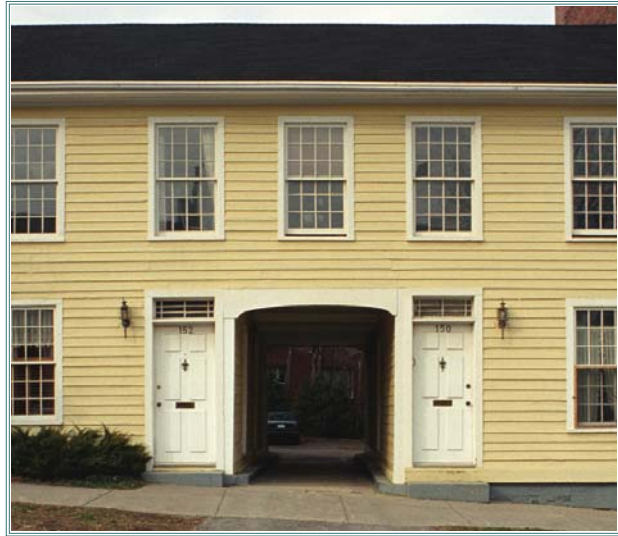
Careful conservation work restored much of the original character of this early frame building of Neo-Classical vernacular with twelve-over-twelve sash, transomed entrances of fine chinoiserie design with panelled doors, and elliptically headed centre carriageway.