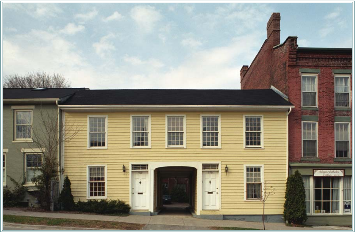
MISSON DUPLEX circa 1843 (RESTORED)

Walton Street Heritage District - Neo-Classic