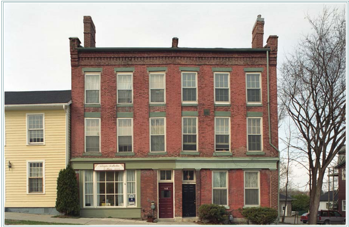
MARSHALL COVERT TOWNHOUSE circa 1850

Walton Street Heritage District - Classic Revival