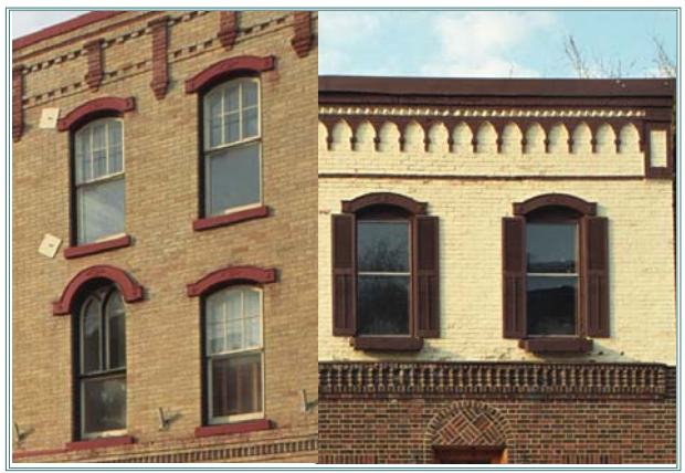
The R.C. Smith Block (48-60 Walton Street) and this building use similar segmental window hood in cast iron and plain cast iron sills. Both buildings incorporate an ornamental brick frieze along the cornice. The modern front brick treatment of the lower front gives the building a less historic character than the two earlier shop fronts seen in archival photos.

As was common at the time, the funerary business was combined with furniture or cabinet making. Funerals took place in private dwellings. Caskets were simple wooden affairs and a secondary business for furniture makers. There was no embalming performed only cosmetic preparation for visitations.