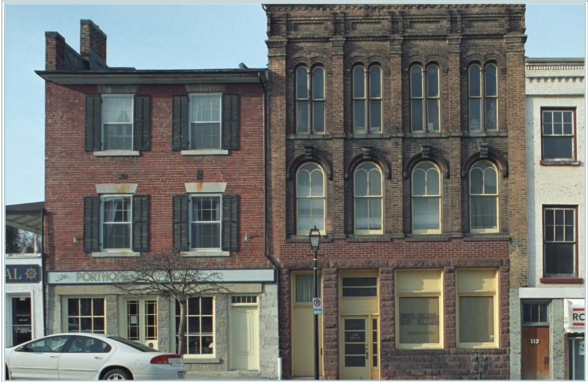
THE GUIDE OFFICE circa 1841

Date Designated: August 30, 1993 to By-Law No. 42/93, SCHEDULE B