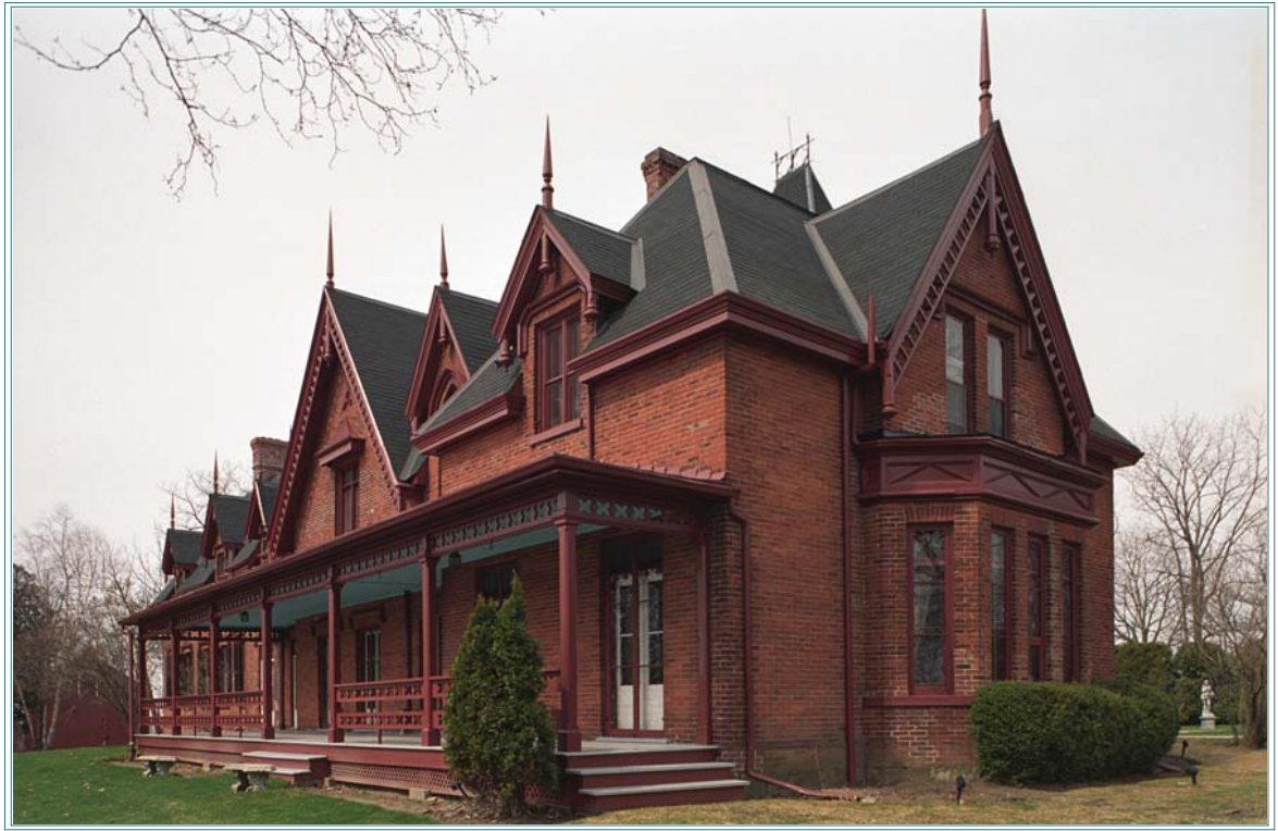
ARTHUR TREFUSIS HENEAGE WILLIAMS HOUSE (PENRYN PARK) circa 1859

Date Designated: August 9, 1983 to By-Law No. 2070, SCHEDULE B-1