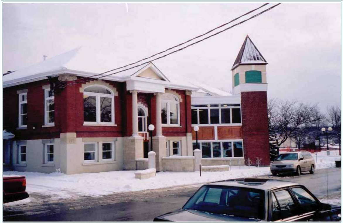
PORT HOPE PUBLIC LIBRARY circa 1912

Date Designated: October 6, 1997 to By-Law No. 44/97, SCHEDULE B-1