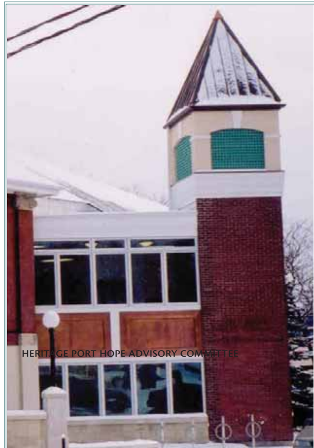
The new addition added to the Port Hope Carnegie Library in 2002.