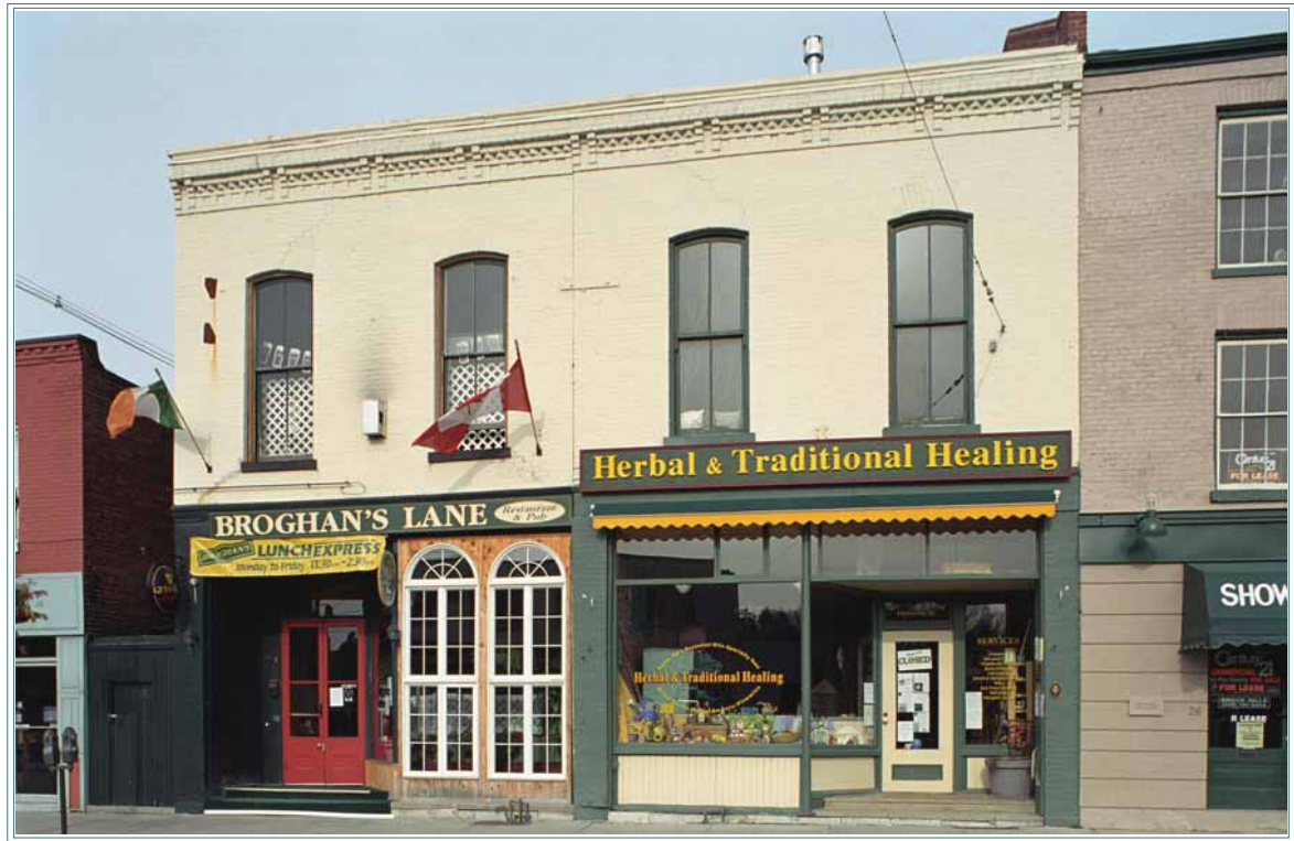
CORNELIUS QUINLAN BUILDING circa 1870

Date Designated: September 19, 1983 to By-Law No. 51/83, SCHEDULE B-4