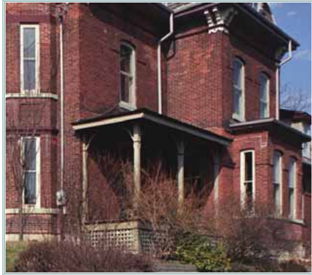
The south verandah was recently restored based on archival photos.