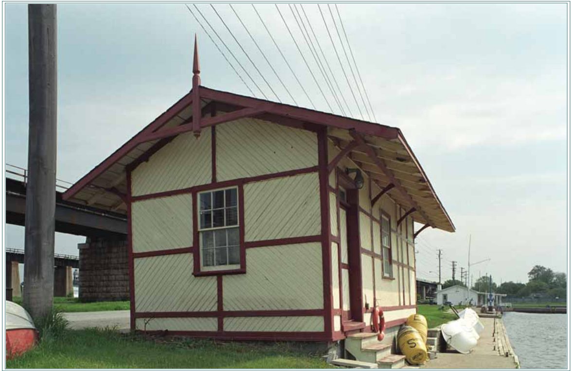
THE LITTLE STATION circa 1855 (MOVED)

Date Designated: February 18, 1980 to By-Law No. 9/80, SCHEDULE B-2