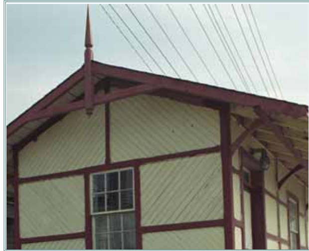
Four inch chamfered strappings divide the exterior walls of the building into decorative panels of diagonal match boarding.