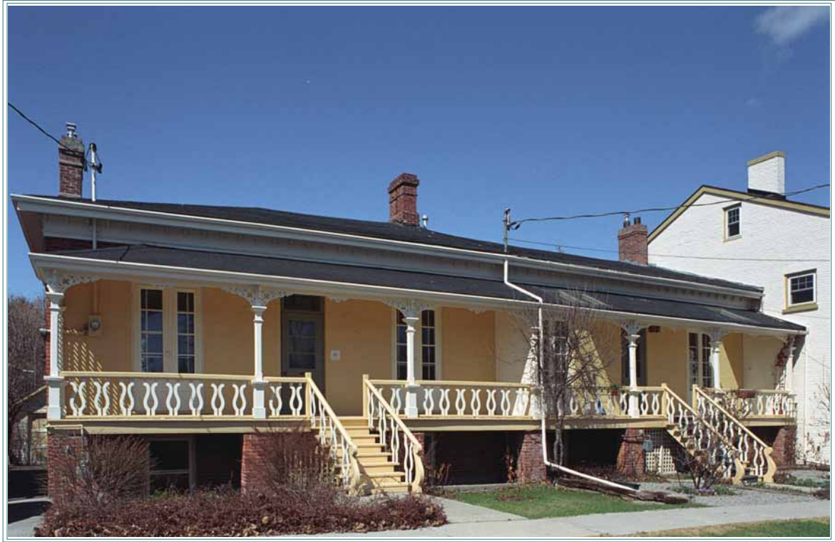
ROBERT YODAN TERRACE circa 1853

Date Designated: May 16, 1983 to By-Law No. 31/83, SCHEDULE B-1