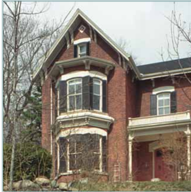
Two storey bay windows and paired brackets to eaves are typical of late Victorian houses.