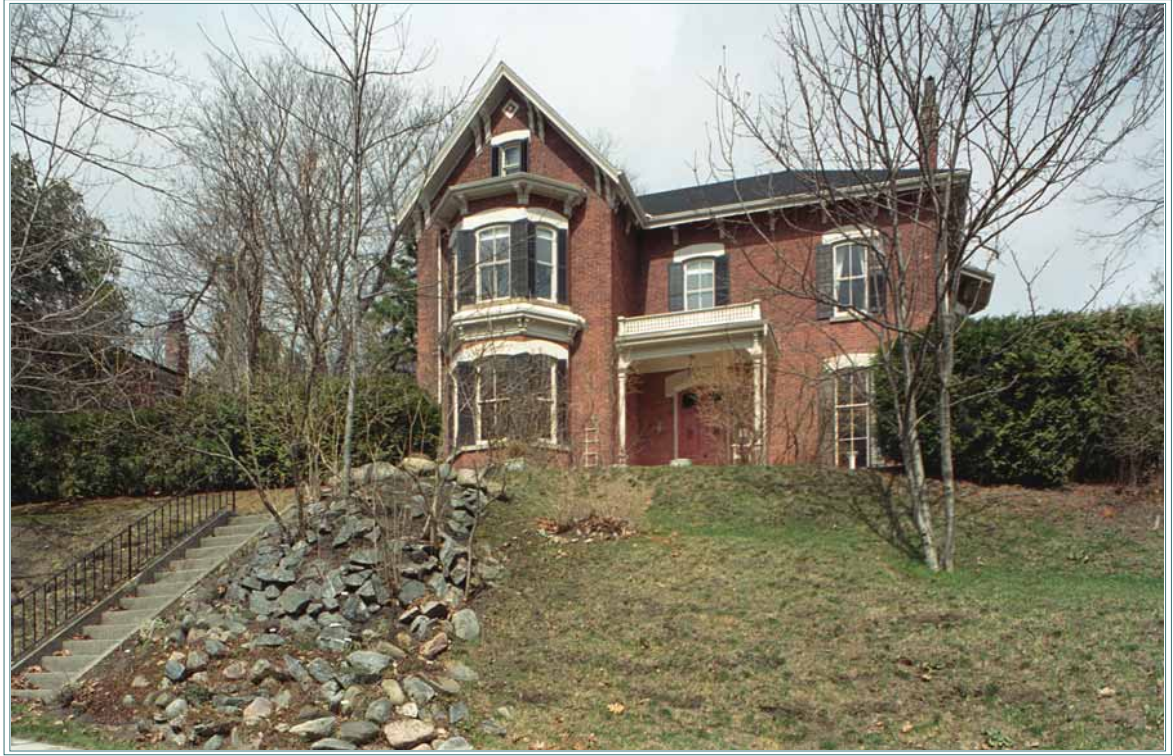
JAMES LEVERICH HOUSE circa 1877

Date Designated: December 6, 1982 to By-Law No. 03/82-83, SCHEDULE B-6