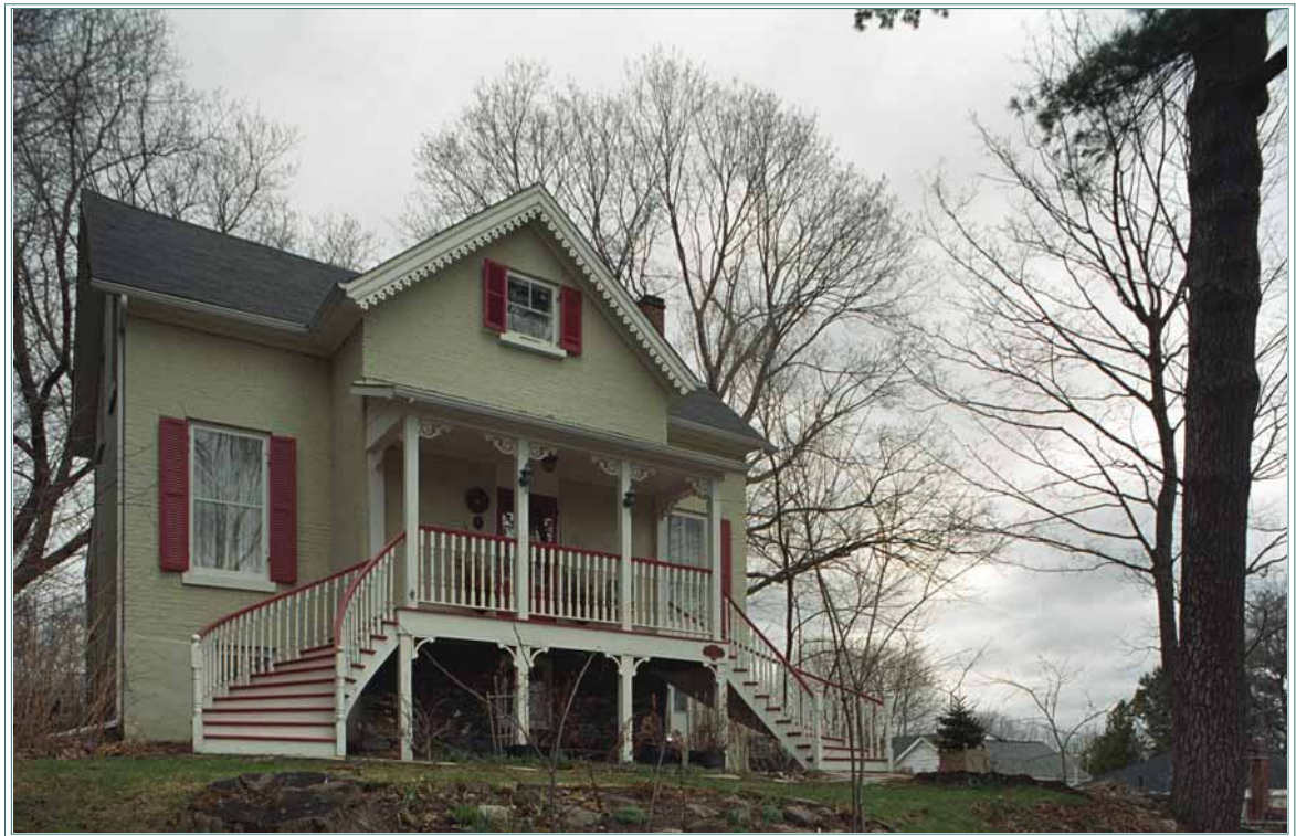
SMITH COTTAGE CIRCA 1865

Date Designated: August 30, 1993 to By-Law No. 42/93, SCHEDULE B-1