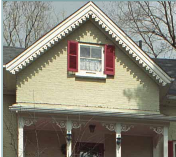
The porch was restored based on archival photos. The sharply pitched gable and decorative trim are typical of the Gothic Revival style.